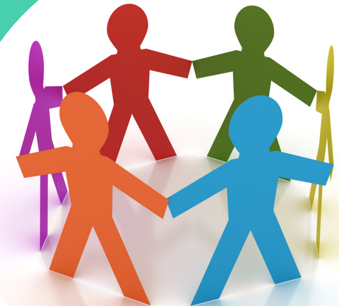
Dedicated Volunteer Reviewers from the Foundation