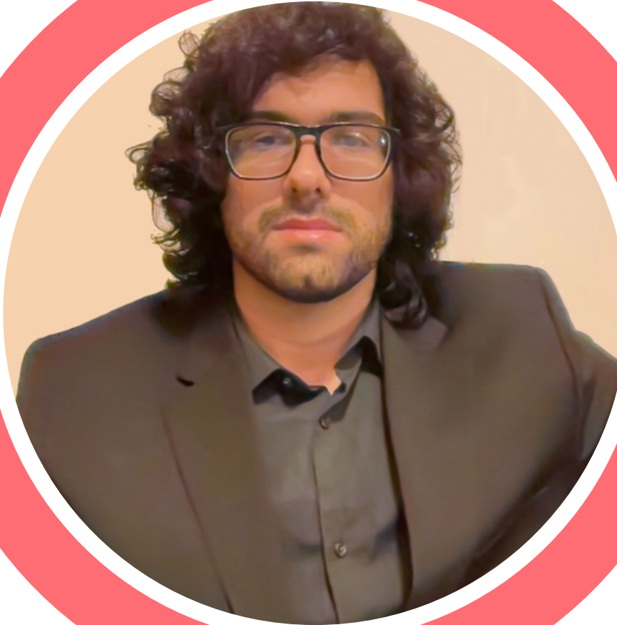
Support from the Office of Institutional Effectiveness