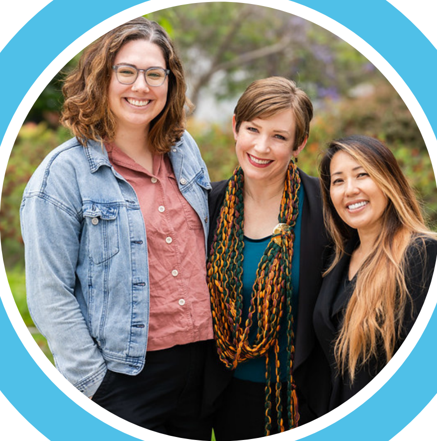
The Office of Resource Development